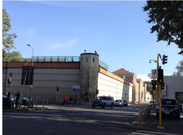
Figure 8: San Vittore Prison, Milan

For example, San Vittore remand prison (see Figure 8) with 800 prisoners and a chaotic family visiting day on Saturday is very different to Bollate prison with 1,300 male and female sentenced prisoners with a more relaxed timetable of family visits during the week.