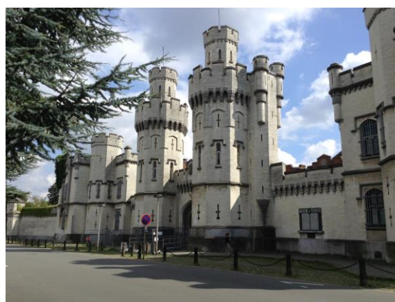
Figure 3: Saint Gilles, Brussels

The visit which I attended was in Saint Gilles prison (Figure 3), a male prison housing 850 inmates.