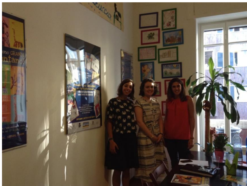
With members of Bambini senza sbarre, Milan.