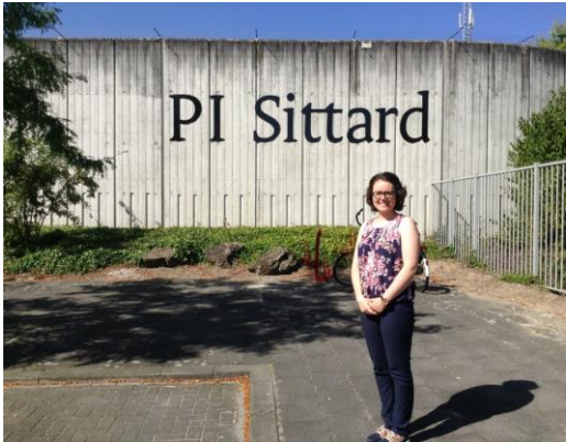
Figure 4: Sittard Prison, The Netherlands

time together was comfortable and effective. I spoke with three fathers during this visit and have included their profiles below (profiles 3, 4 & 5). Their accounts, once again, show the gratefulness of focused family intervention work from Exodus, allowing these men to maintain a relationship with their children.