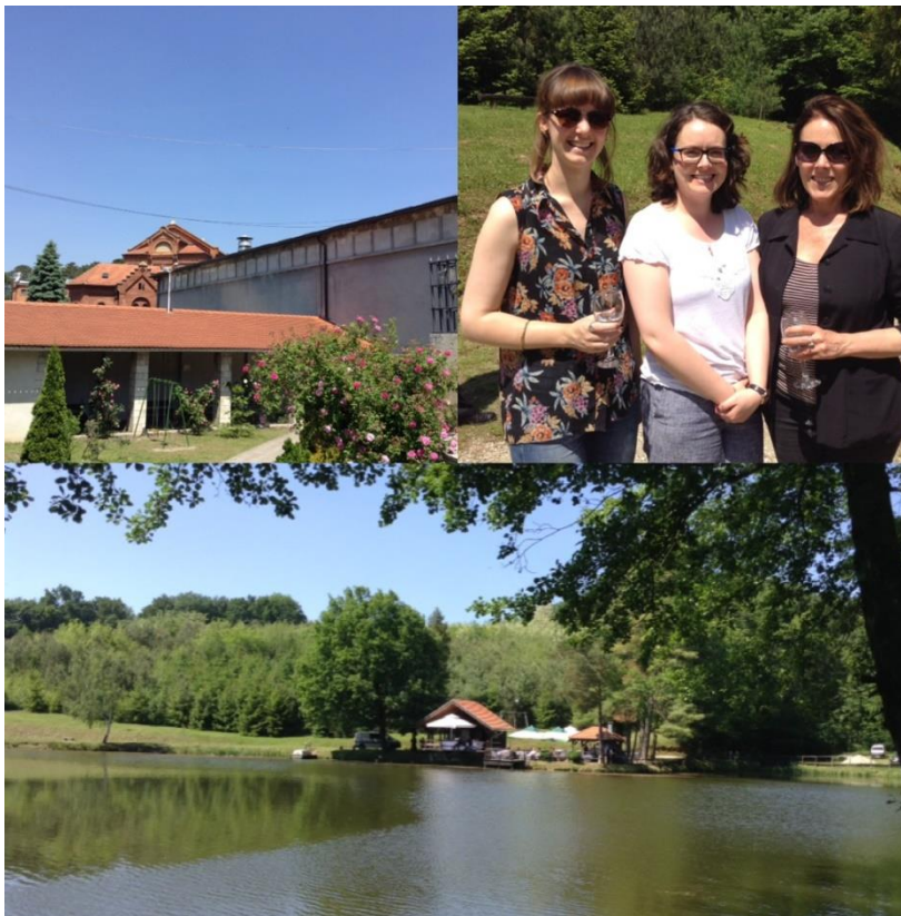
Top Left: Lepoglava Prison