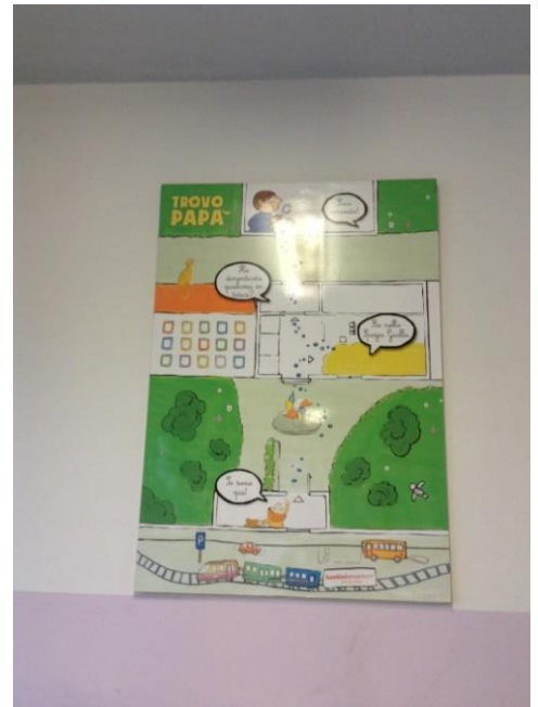
Figure 7: Trovo Papà (Find Dad) in visits waiting room in one prison in Milan.

I have developed similar resources, with Bambini's permission, for use with Barnardo's and Northern Ireland prisons, with the aim of achieving the same positive engagement with children during visits as Bambini.